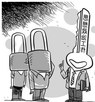
Figure 2 Moral anomie

Under the background of diversified social development, most colleges and universities gradually attach importance to the role of ideological and political teaching, accelerate the progress of ideological education optimization, and expand the scope of ideological and political education for students. However, many colleges and universities often ignore the key steps of teaching communication because of various factors, and pay little attention to the surrounding environment of students' life, which has a great adverse effect on the orderly development of ideological and political teaching in colleges and universities, which makes the ideological education work in colleges and universities have to face "ecological dilemma ". The concrete manifestation is that there is no timely and effective communication and cooperation with the students' families and the social environment, which greatly weakens and restricts the development trend of ideological and political education work in colleges and universities in our country, which makes it impossible for families, schools and society to form the result of education, and not even some college students have the phenomenon of moral anomie [3].